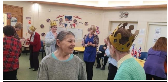
Celebrating our Kings Coronation