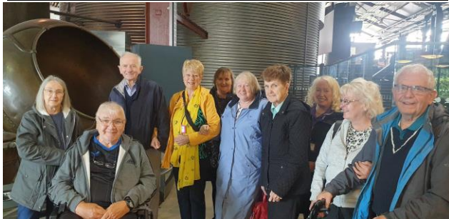
Our visit to the Summerlee Museum of Scottish Industrial Life