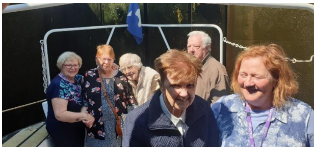
Our visit to Seagull Trust in Linlithgow