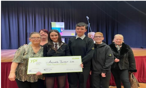
Our winning YPI team from Whitburn Academy