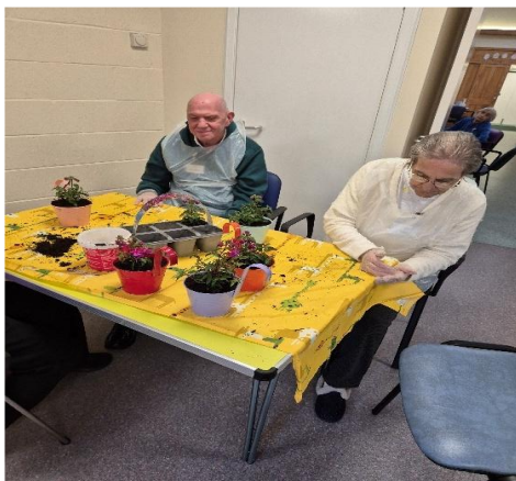
Potting some plants for the garden