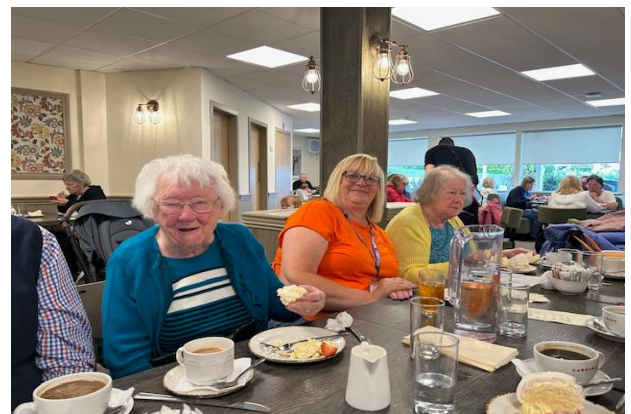
Trip to Caulders Garden Centre for cake!