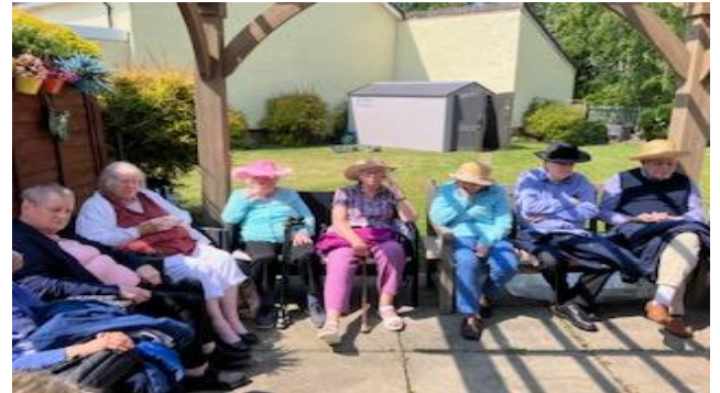
Enjoying the sunshine