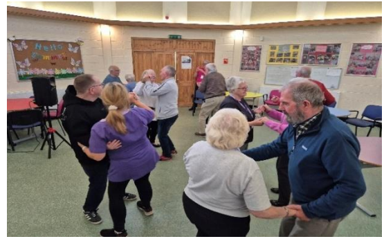
Dancing to one of our monthly entertainers